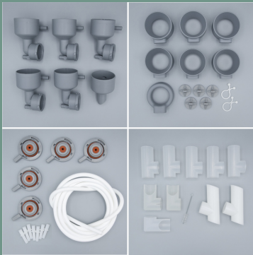
Hygiene Kit - Multi-brewer Grey