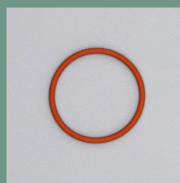
O Ring - Mixer Base