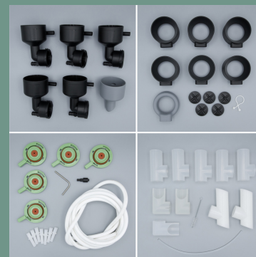
Hygiene Kit - Multi-brewer Black