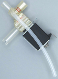
Valve - 24V 8mm Low Scale Adjuster