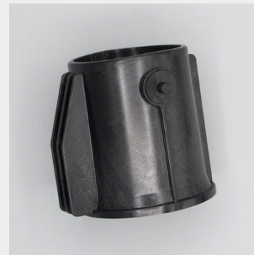
Tea Brewer Cylinder