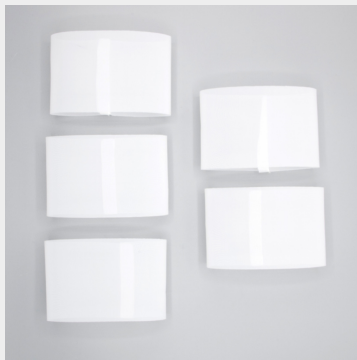
Brewer Band Filters (Multipack)