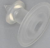
Seal - Valve Membrane