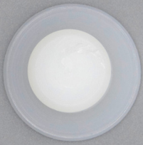
Boiler Port Blank Plug