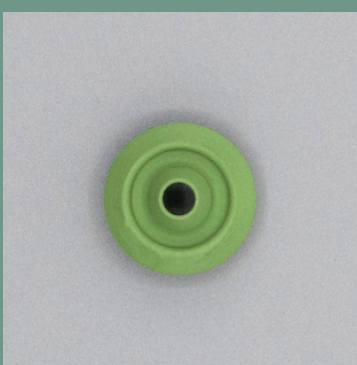
Mixer Shaft Seal - 4mm Green