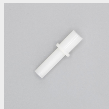
Spout Dispense Tube