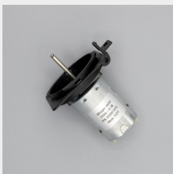
Motor - Whipper 13000RPM 24VDC